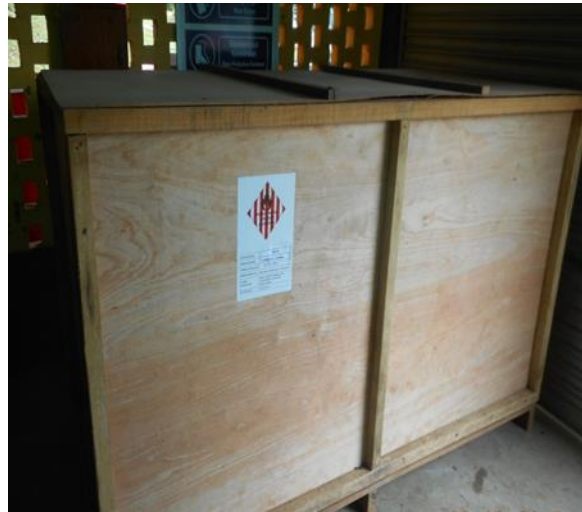
Appropriate labels are used for each Scheduled Waste